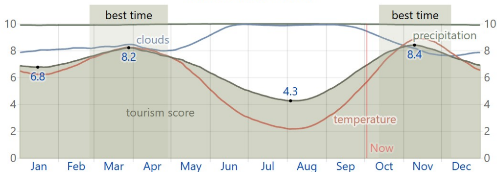
The tourism score (filled area), and its constituents: the temperature score (red line), the cloud cover score (blue line), and the precipitation score (green line).